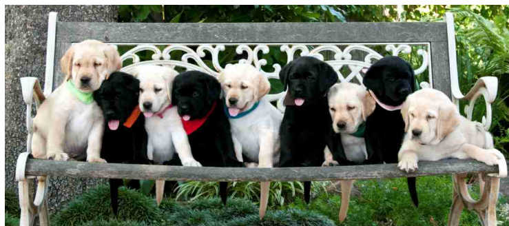
Ember's "T" Litter