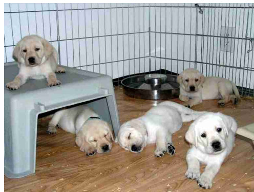
Hilani's "F" Litter "Hangin' Out"