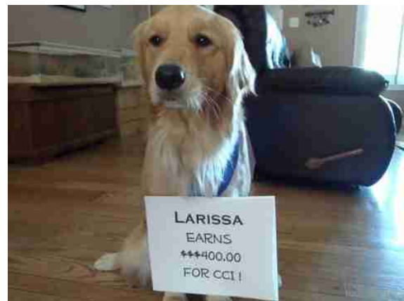
Lovely Larissa Raises Funds For GRC Bone Appetit !