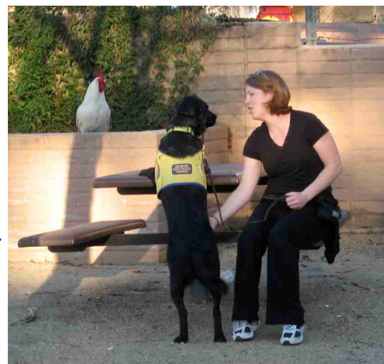
Fair Oaks Park

Besides your own neighborhood some ideas include small urban settings, the beach, the woods, parking lots, etc. You can make almost any trip out a chance for a safe and appropriate socialization. Be sure to take the puppy on socialization outings both day and night. Dogs may become fearful of going out at night or avoid things they don't have an issue with during the day.