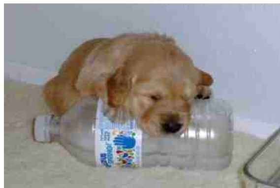
Halor's "L" Pup Beats The Heat